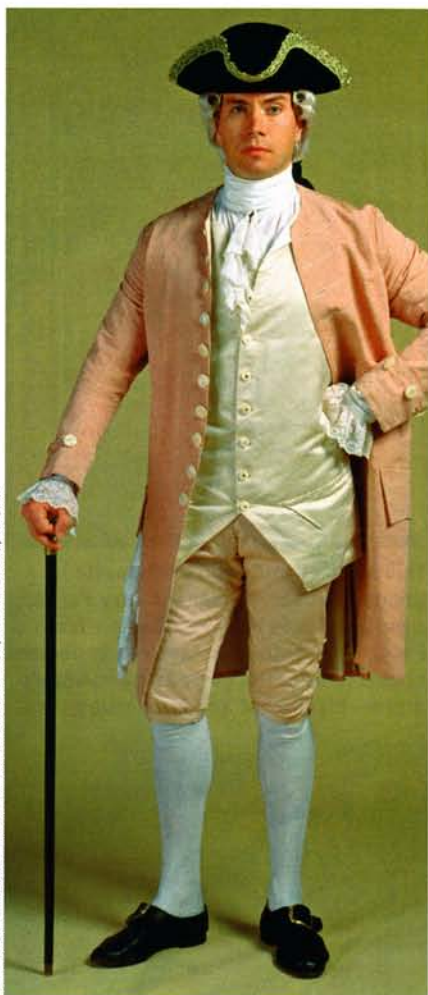
The interpreter portraying Thomas Jefferson at Colonial Williamsburg models a wealthy gentleman's fashionable attire, including his walking stick. Canes in the American colonies were usually imported from Europe, while local craftsmen created them in much smaller numbers.

is that “cane” dates to ancient Rome and the Latin canis , for dog, when pedestrians often carried walking sticks to defend themselves from roaming packs of canines.