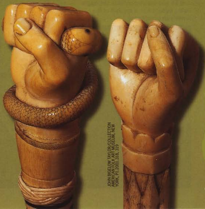
P.1.2001.318, 319