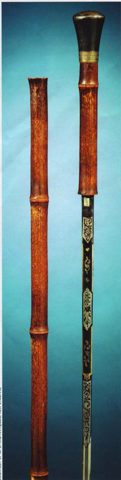
This bamboo walking stick, topped with an intricately inlaid knob handle, conceals a blade of blue Toledo steel. The Spanish steel used to create swords, first mentioned as early as the 1st Century B.C., is legendary for its tremendous strength. Today, these 19th-Century blades are heralded for their unrivaled quality, masterful craftsmanship, and fierce beauty.