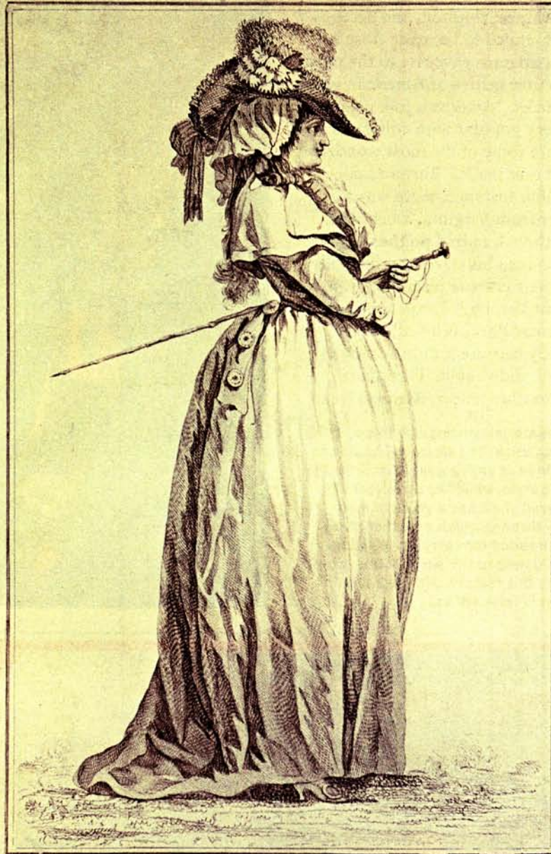
Redingote du matin surmontée d'un large Collet Revers et Poches accompagnées de Boutons de brillant, Chapeau léger sur une coiffure négligée. 1787

Women carried walking sticks from the 11th Century on and considered them fashion essentials in the 18th and 19th Centuries, as shown here in this 1787 French print. Women's canes often were decorated with tassels and ribbons corresponding to colors in their attire.