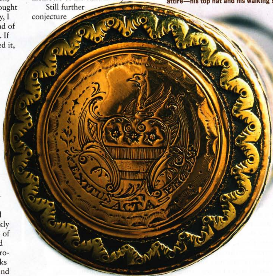
This cane, one of the first two objects the Mount Vernon Ladies' Association obtained in 1857, is likely the "very handsome gold headed cane" General George Washington received as a gift in December 1784 in recognition of his leadership during the Revolution. He took pains to have the top engraved with his coat of arms and the Washington family motto, Exitus acta probat ("The end proves the deed"). Presented to Massachusetts scholar and politician Edward Everett (1795-1865) in appreciation for his fund-raising efforts to help purchase Mount Vernon, the cane eventually came back to the estate in 1911, a gift from Everett's granddaughter.